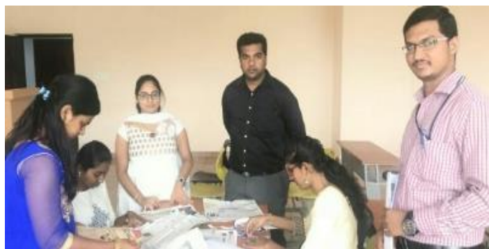
Finance club activity in progress