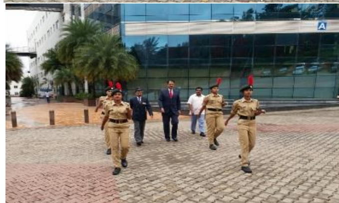
Independence Day celebrations