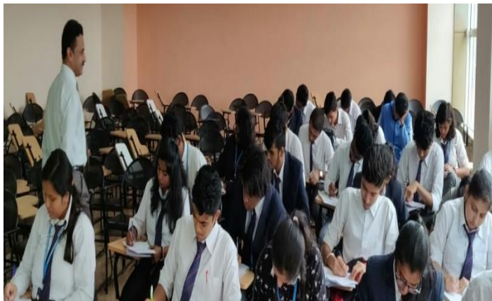
Students participating in the essay competition

Student clubs at DSBA conducted club activities on 25 th August 2018, which included the following events: