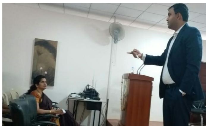
CA and CPT orientation Session