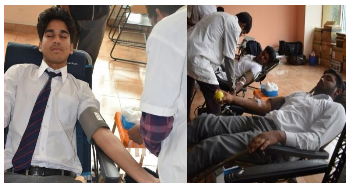
Blood Donation in Progress ,