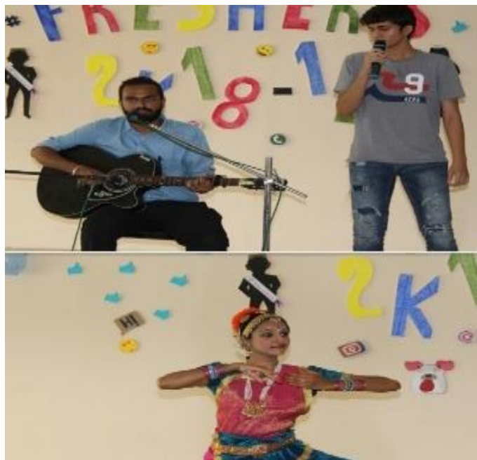
Fresher's Day celebration