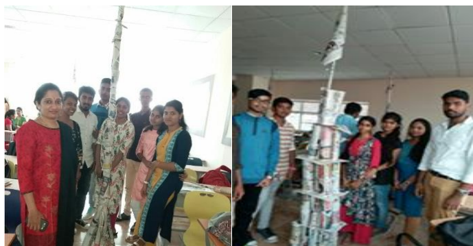
Students participating in Tower Building Activity

This activity encouraged team building and problem solving and helped groups learn to communicate effectively.