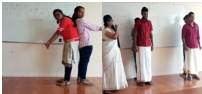
Marketing club activity