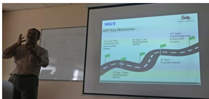
Tally and GST in progress