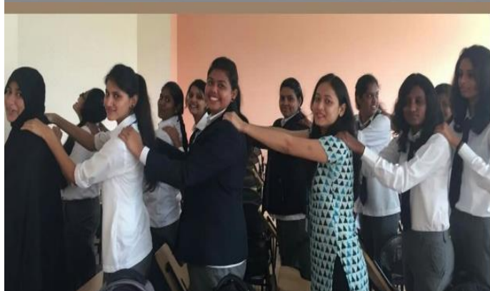
CIL Session in progress