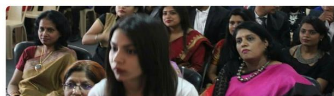
Orevwa – farewell to students