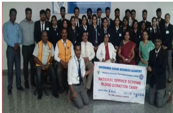
NSS Blood Donation Camp