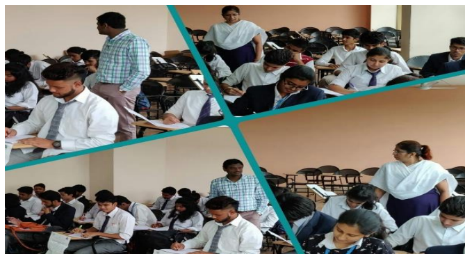
Students Participating in the Essay Competition

The All India Essay writing Event is the flagship event of the partnership between the United Nations Information Centre for India and Bhutan [UNIC], Shri Ram Chandra Mission [SRCM] and The Heartfulness Education Trust for development of program content for the youth. They invited undergraduate students to participate in the essay writing event held at DSBA on 10 th August 2018. Large number of undergraduates from all three programs B. Com, BBA and BCA enthusiastically took part in the event!