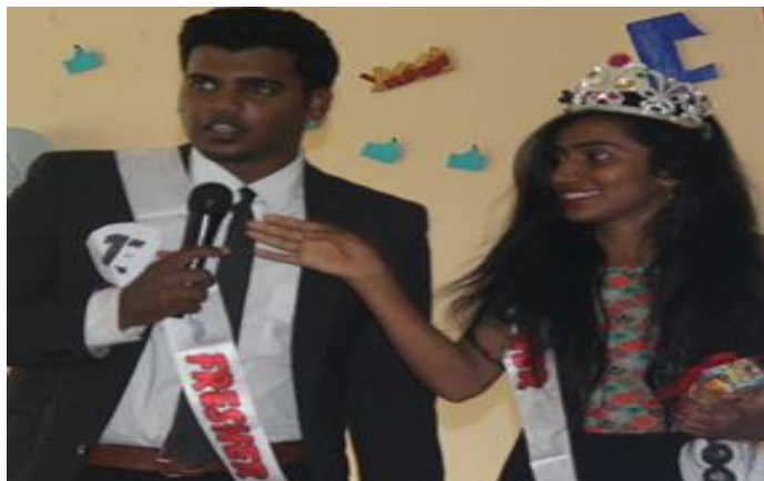
Mister & Miss Fresher of DSBA '2018

The programme ended with an assortment of delicious snacks arranged by the seniors for the freshers.