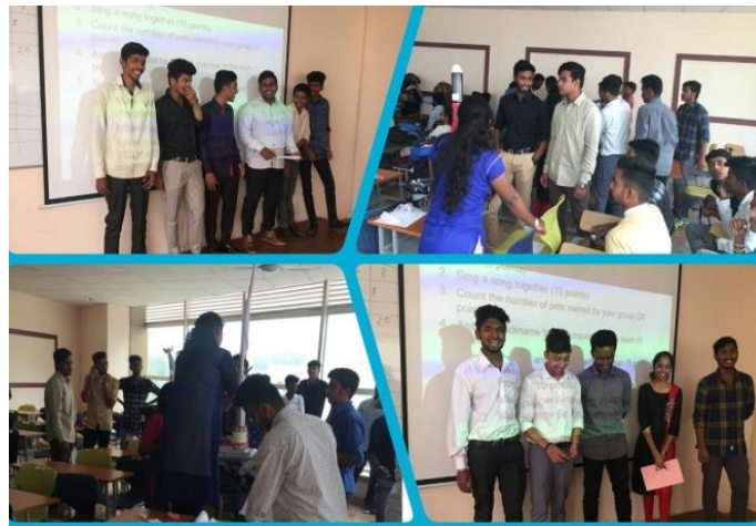
Bridge Programme in progress