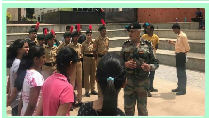
NCC selection process in progress