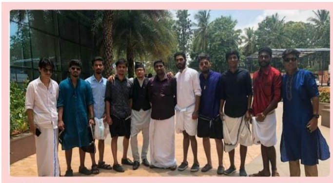
Ethnic day celebration