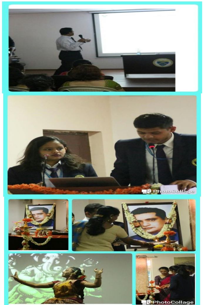
Inauguration of the Batch of 2018-21