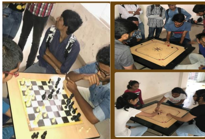
Inter-class indoor sports competition in progress