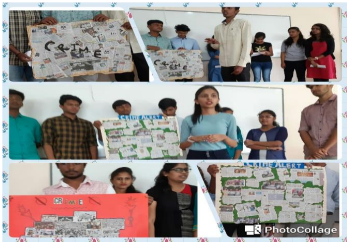
Students participating in Collage Activity