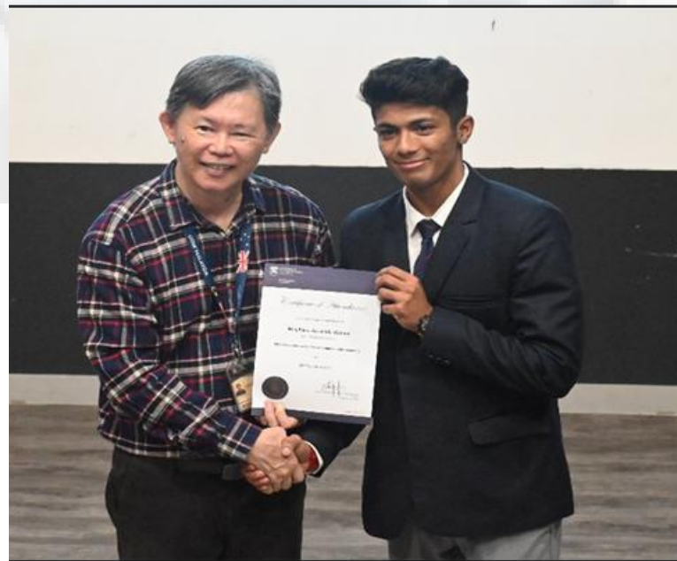
GIP at University of Wollongong, Kuala Lumpur, Malaysia, Batch 2022-25