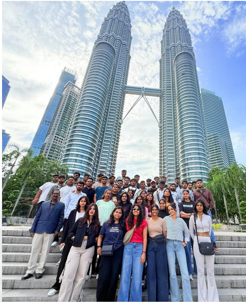
Training Program at the University of Wollongong, Batch 2022-25